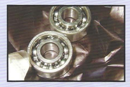
CLEAN PROTECTION: No longer do you need sprays, dips, vapors or other volatile packaging to protect precision equipment and parts. Intercept streamlines processes and simplifies your operation, delivering results indoors or outdoors.